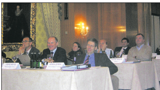
General Assembly in classroom style